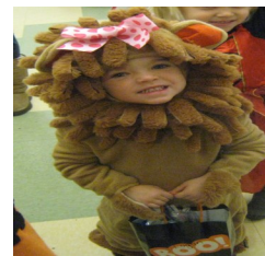
Logan is a lovely lion.