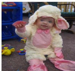
Avery is a sweet little lamb.