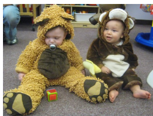
Taryn and Collin are ready to show their costumes off.