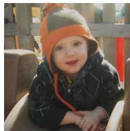
Preston takes a break at the top of the slide.